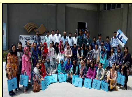
Study Visit of Textile Sciences students at Feroze 1888 (HUB)

The directorate shared Job placement forms/ CV, Graduate directories/ Posting of Job flyers at NED-DIL website and on Departmental noticeboards. 26 industries have been facilitated for the job placement activity.