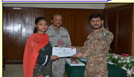
Distribution of Internships Certificates at PEC KAMRA.

47 Industrial / Study visits were arranged.