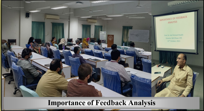
Importance of Feedback Analysis