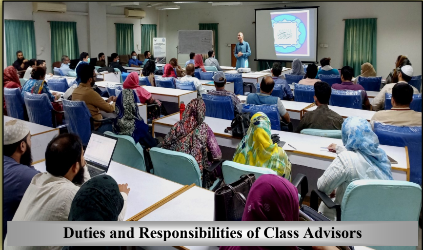
Duties and Responsibilities of Class Advisors