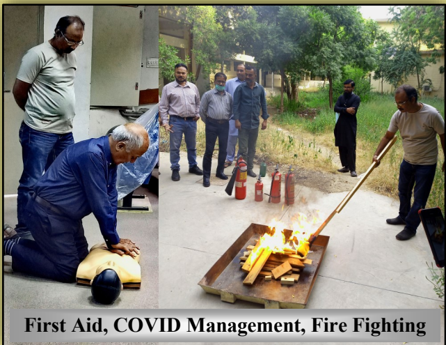
First Aid, COVID Management, Fire Fighting