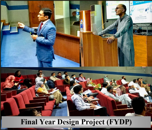
Final Year Design Project (FYDP)