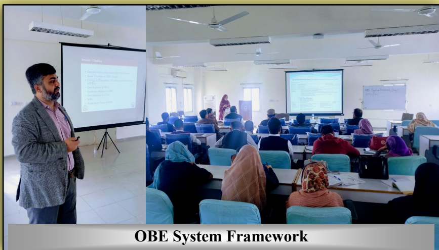
OBE System Framework