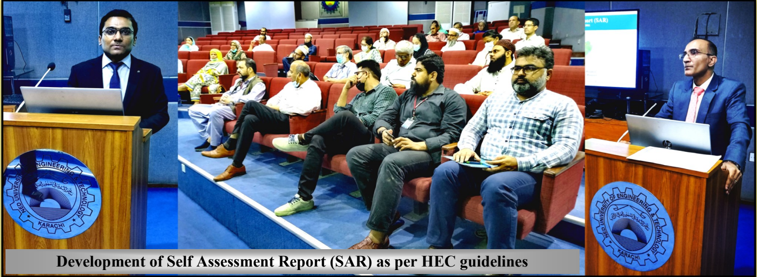
Development of Self Assessment Report (SAR) as per HEC guidelines