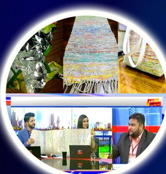
Utilization of waste Wrappers for useful Products