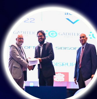
ITEC - 2022