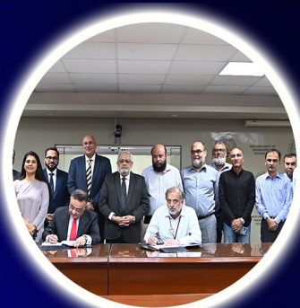
NED UET signed MoU with TransKarachi

Third issue of QEC Newsletter of the year 2022 has been made readably available and accessible to all stakeholders. The desired objective of this periodic publication is to keep informed stakeholders about the latest developments and advancements in the University. Your esteemed feedback and valuable comments are always appreciated for further developments and improvements. Newsletter is available on qec.neduet.edu.pk